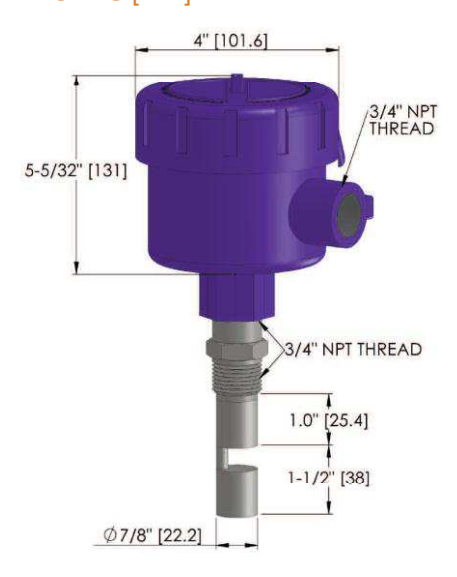
Figure 1: LL-101 series elements